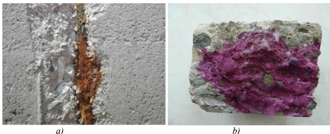
Fig. 2 Carbonation of concrete

results in stress formation and delaminating of concrete covering layers (Fig. 2a). Corrosion is accelerated by removing the covering layer [5].