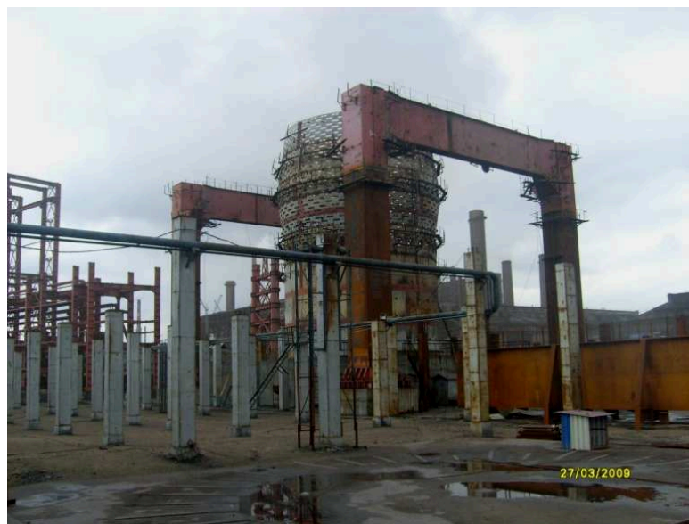
Fig. 2. Blast Furnace– Alchevsk Ukrajina

When the complete form is finished the first step of risk analysis is done. The description of consequences, realization of hazard and importance hazard UMRA is adjusted, logical and numerical parts are worked up. Logical part is description with instruction for fill experts’ matrix.