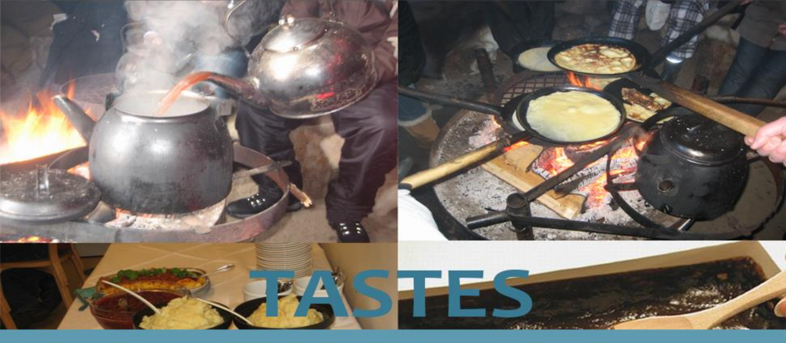
Just try it