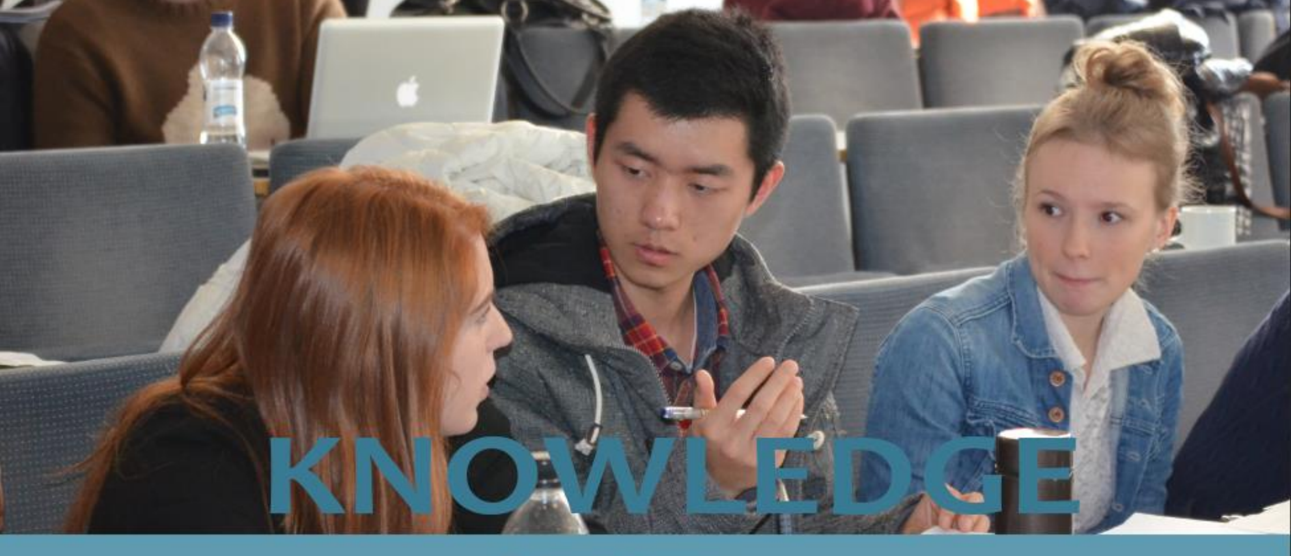
The first steps to success