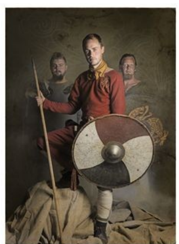
Join us in 2019 Do you accept the challenge?