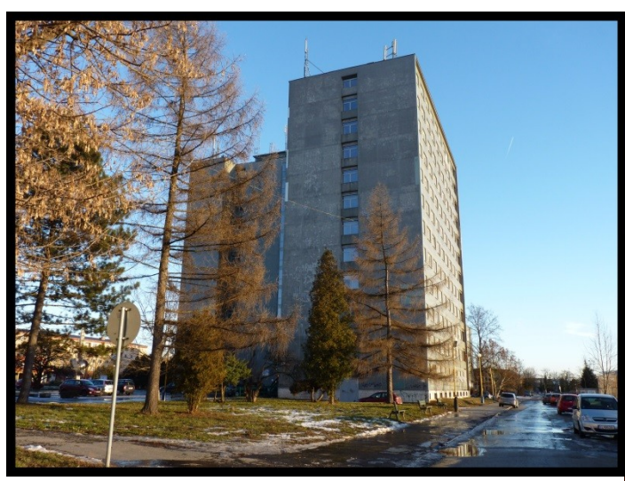
Halls of Residence