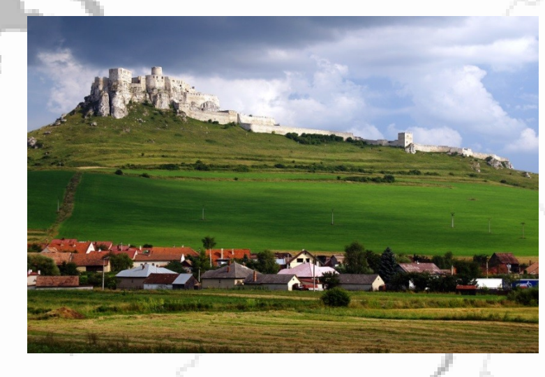
Beauty of SLOVAKIA