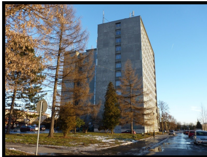
Halls of Residence